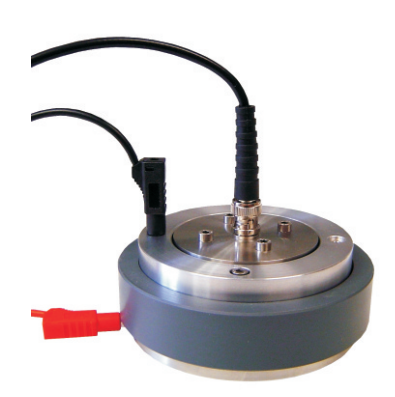
Volume measurement Yarns and fibers

H.-P. FISCHER ELEKTRONIK GmbH & Co. Industrie- und Labortechnik KG Karl-Metten-Ring 1